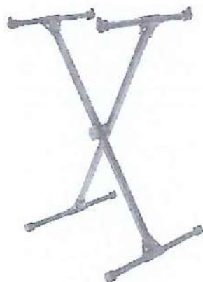
Single Braced Keyboard Stand