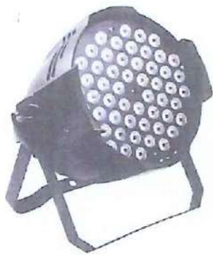
LED Stage Light